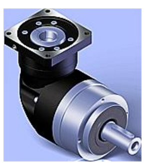
The AE-Series are the cost-effective option.