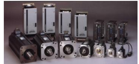
Gen 3 and ORION controllers, drives and motors provided decades of precise motion control.